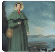
Mary Anning studied fossils and shared her knowledge.

There have been many significant people throughout history. These are some examples.