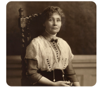
Emmeline Pankhurst stood up for women's rights.