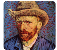
Vincent van Gogh created a new style of painting.