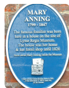
Plaque for Mary Anning