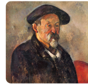
Paul Cézanne helped to create a new style of art called Cubism.