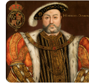
Henry VIII was the king who formed the Church of England.