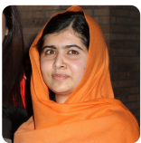
Malala Yousafzai campaigns for girls to have the right to go to school.

Significant people are still making big changes in the world today.