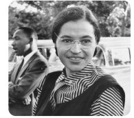
Rosa Parks wanted black people to have the same rights as white people.