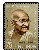
Stamp of Mahatma Gandhi