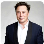
Elon Musk is trying to make a rocket to go to Mars.