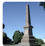
Monument to Captain James Cook