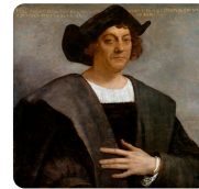
Christopher Columbus was the first European person to discover the Americas.