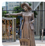
Statue of Emmeline Pankhurst