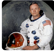
Neil Armstrong was the first person to walk on the Moon.