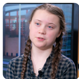
Greta Thunberg campaigns to stop climate change.