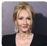
JK Rowling wrote the Harry Potter books.